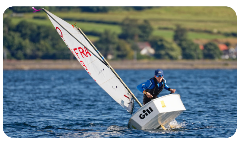
Full results can be found here: https://iocauk.ourclubadmin.com/event.php?event=5

Next year I want to take that "best club" trophy off of Parkstone YC please, so lend a hand and help me make it happen ☺